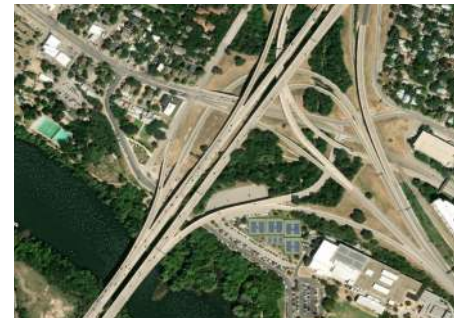
Vivid | 30 cm | Austin, Texas, United States