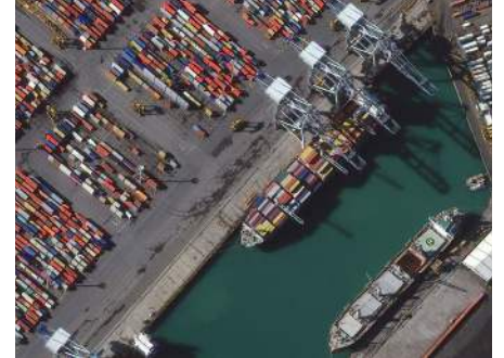
WorldView-3 | 30 cm | Auckland, New Zealand