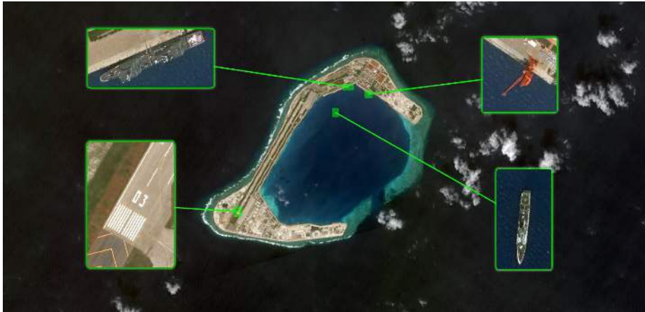
WorldView-3 | Pan-sharpened natural color